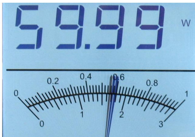
Fig. 1-4 Needle Display in Tail mode