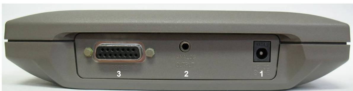
Fig. 1-2 TUNER Connectors