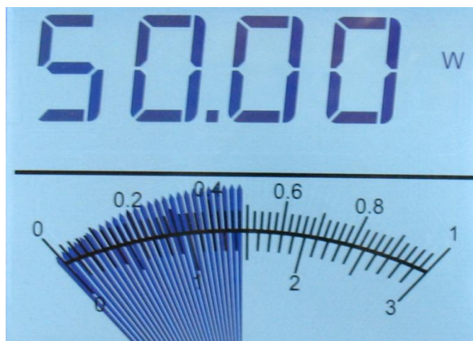
Fig. 1-5 Needle Display in Bar Graph mode

When the batteries are discharged enough to compromise the measurement, the TUNER displays "LO BATT" instead of the measurement. Refer to section 3 to replace the batteries.