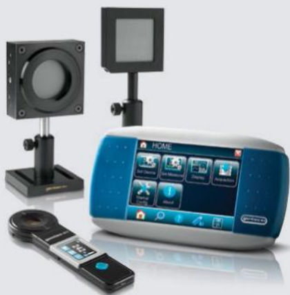
POWER & ENERGY METERS