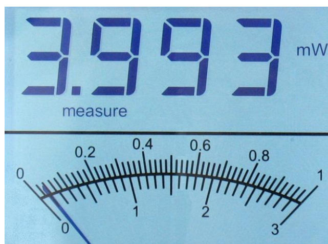
Fig. 1-3 TUNER LCD Display

The LCD provides measurement information, wavelength information, range information and other useful messages.