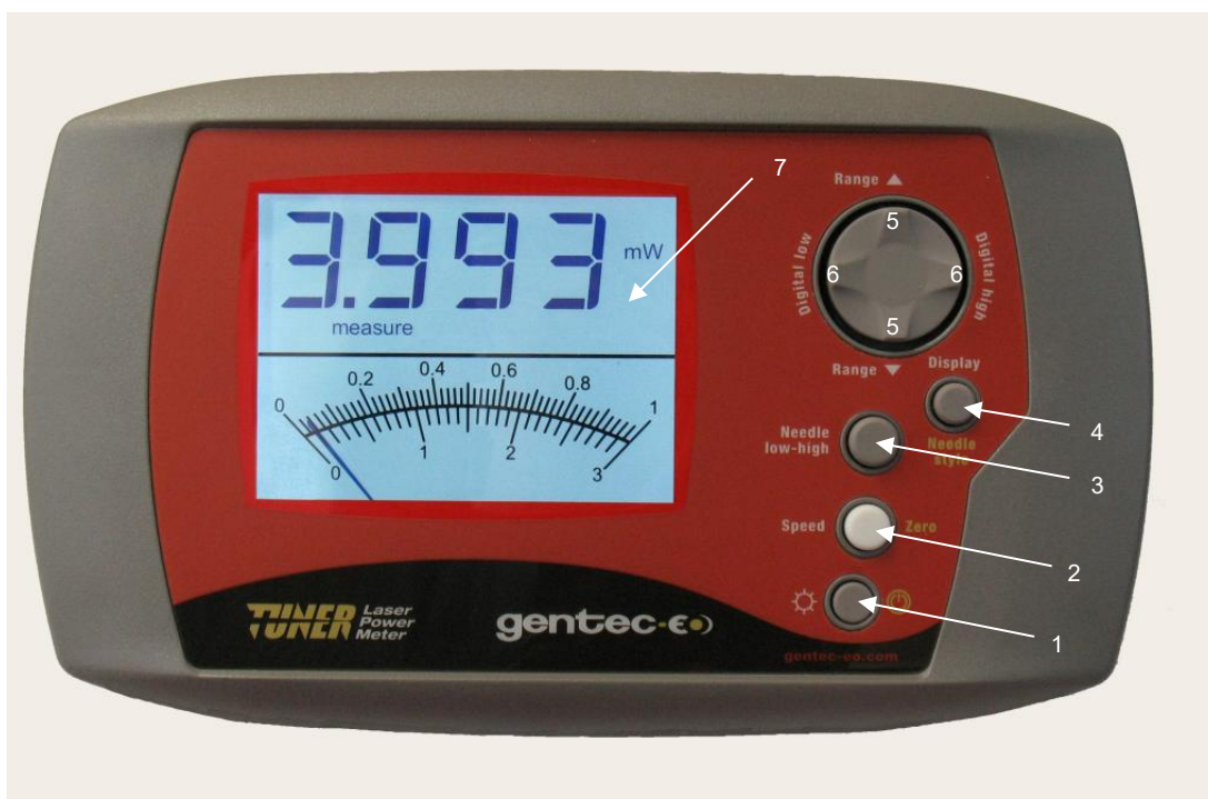
Fig. 1-1 TUNER Front Panel