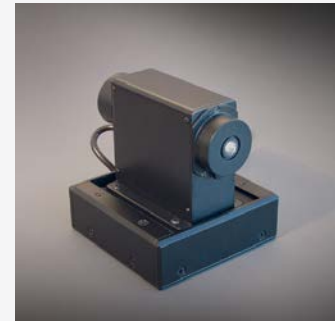
Figure 1: Golay Cell (without the power supply)

A Golay Cell is a "photo-acoustic" device that is sensitive, works at ambient temperatures and has a broad spectral response. The basic elements that make up a Golay Cell are: a 6 mm HDPE or diamond window, a small fragile gas chamber that includes a thin, partially absorbing metallic film and what is called an "optical microphone section". When THz radiation is transmitted through the window and absorbed by the thin metallic film in the gas cell, the gas is heated, causing it to expand and distort the mirrored back wall of the cell. This distortion (or movement) is monitored and measured by the combination of an LED, some optics, a grating and a photodiode. The output of the photodiode is proportional to the displacement of the mirrored wall of the gas cell. Its output is calibrated against a source of known power output in Volts/Watt.